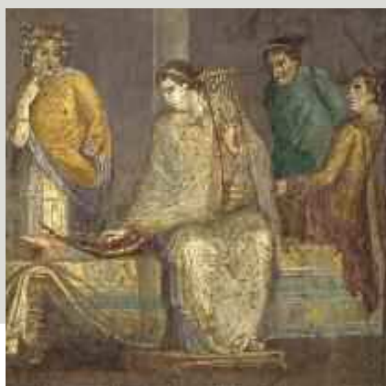
1. The Concert , frescoed wall painting from Pompeii, AD 30, National Archeological Museum of Naples. Covered by the eruption of Mount Vesuvius in AD 79; not unearthed until mid-1700s.

Roman frescoes of the first century are remarkable for depicting fully rounded figures sitting and standing in easy postures within a credible space. Each form is rendered impressionistically in loose brush strokes that leave no trace of an outline.