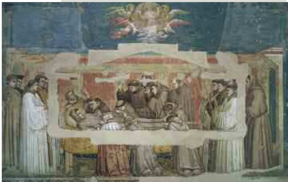
20. Giotto, Funeral of Saint Francis , c. 1315-20, Bardi Chapel, left wall.

Where the paintings are disfigured tombs were at one time attached to the walls.