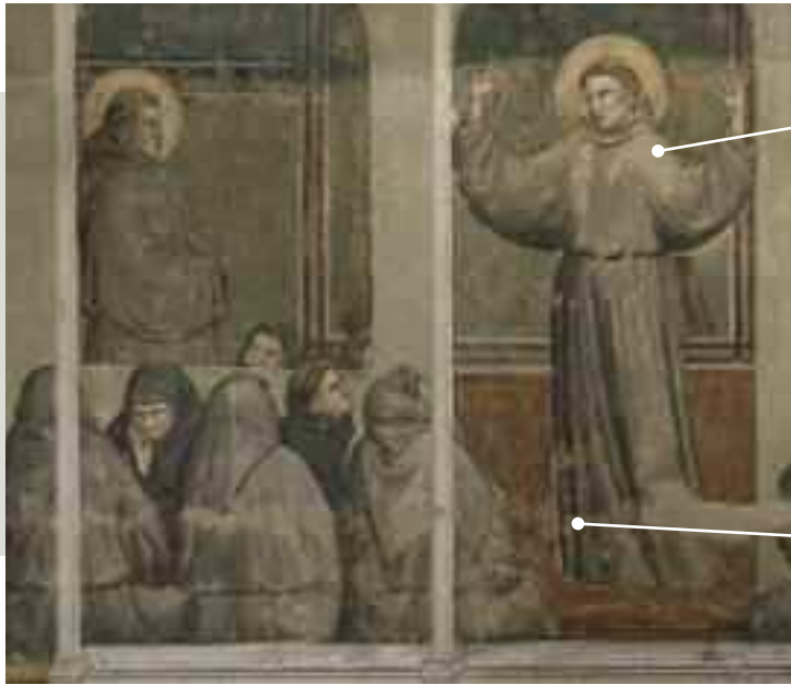
21. Giotto, detail of fig. 19.

We perceive the massiveness of the monks not only because of their silhouettes, but also because of the way Giotto's directed light shapes their volume. The parts that protrude toward us are bathed in highlights , while the opposite, receding sides are darkened by shadow.