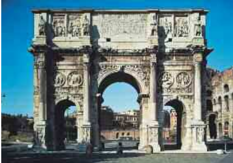
2. Arch of Constantine, 315 AD.

But if our Florentine had stood before one of the few intact monuments left in Rome, the Arch of Constantine (315), he would have been perplexed. Above the two side arches were (and still are) two pairs of roundels containing sculpted reliefs that had been scavenged from imperial monuments of two centuries earlier and patched in place by Constantine's own craftsmen (figs. 2 and 3).