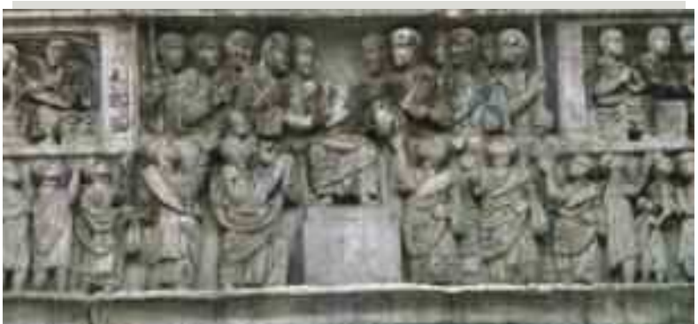
4. Detail of the arch's frieze, 315 AD.

Constantine, his head missing, sits in the center on a throne with his court seated to either side. His subjects are kneeling below with out-stretched hands. Suffice it to compare the naturalistic, looping folds in the tunics of the roundels with the schematic patterns in the folds of Constantine's frieze.