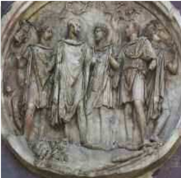
3. Imperial Lion Hunt , roundel scavenged from one of Emperor Hadrian's monuments, mid-second century, Arch of Constantine.

Emperor Hadrian and his hunting companions are standing over a dead lion.