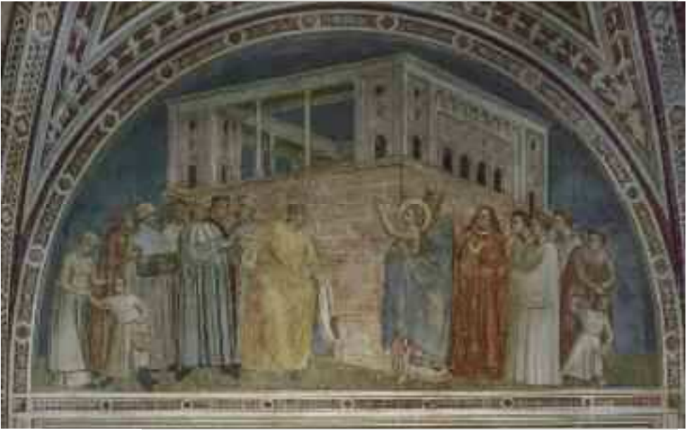
22. Giotto, Francis's Renunciation of His Possessions , c. 1315-20, Bardi Chapel, left wall

The corner of the masterfully foreshortened building accents Francis, while the receding wall underlines the father's outstretched arm.